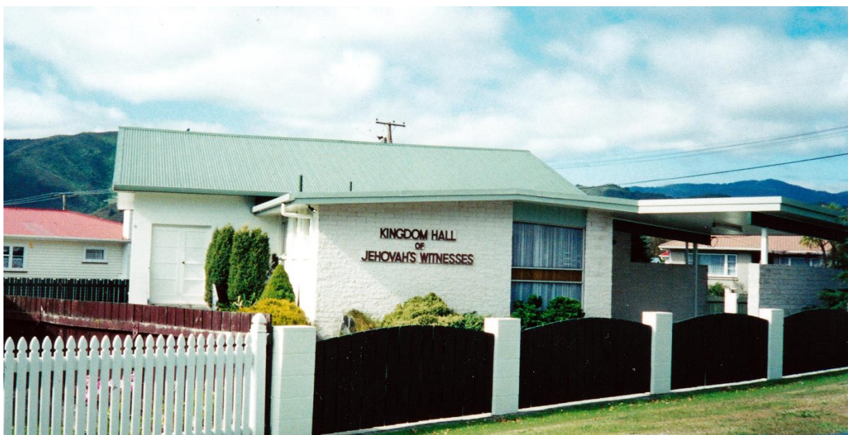
Former church building now used as a residence 2021.