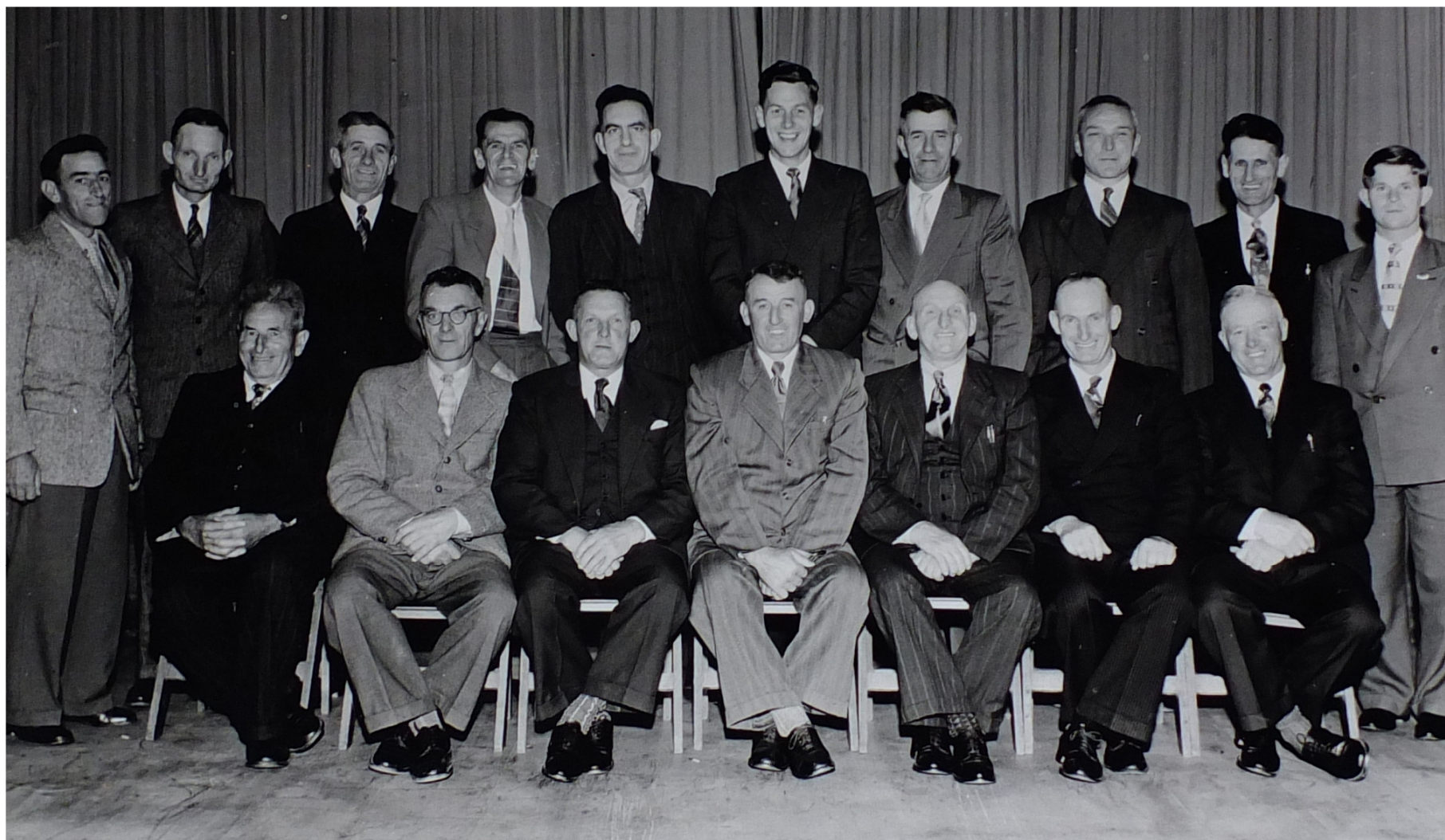
Avalon (Taita) Public Hall – 35 th Anniversary Celebrations Committee, 1957